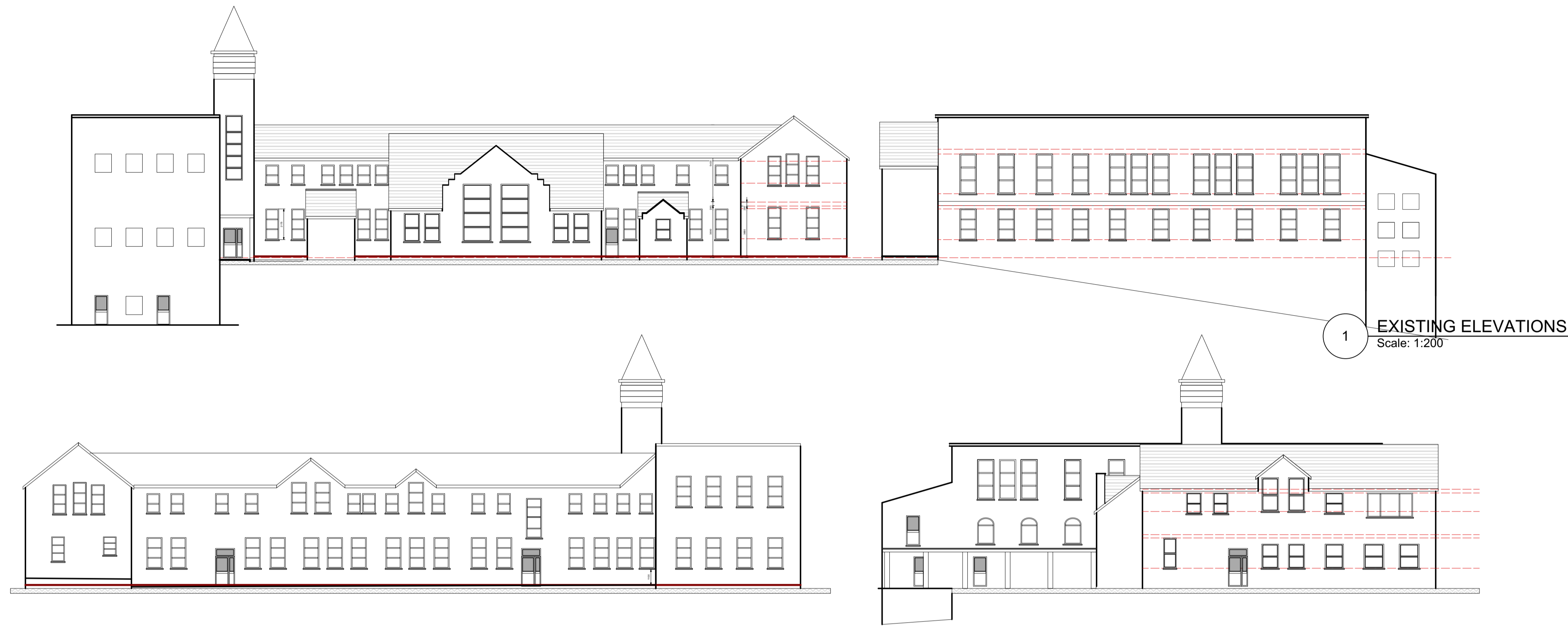
1 EXISTING ELEVATIONS Scale: 1:200